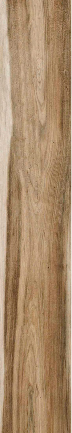
23 x 120 cm (9 x 48) UN.SB.NAT.0948