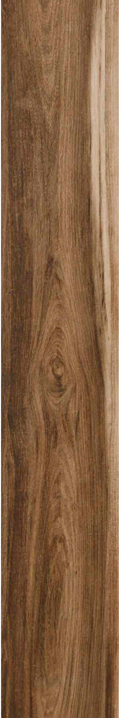
23 x 120 cm (9 x 48) UN.SB.TAB.0948

All items shown in this document are part of Olympia's stocking program. For special orders, please contact your Olympia Tile Sales Representative.