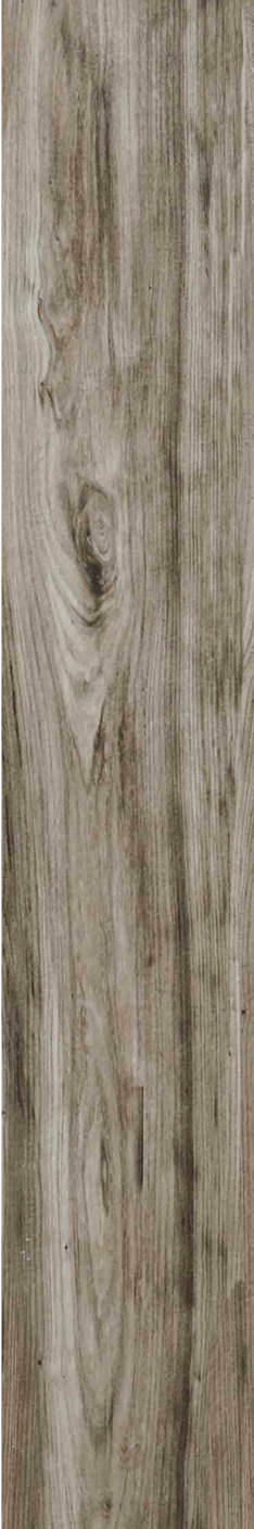
23 x 120 cm (9 x 48) UN.SB.GRS.0948