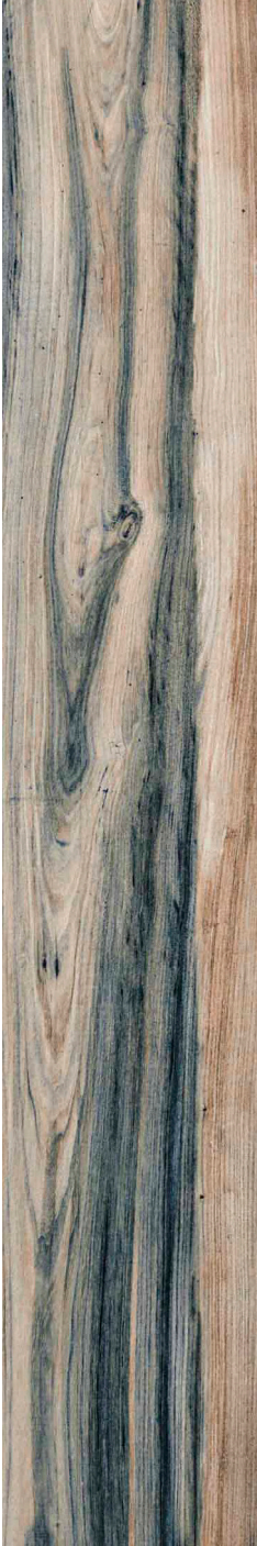
23 x 120 cm (9 x 48) UN.SB.CIE.0948